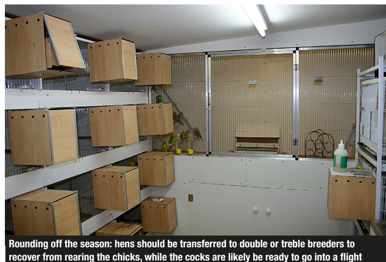
Rounding off the season: hens should be transferred to double or treble breeders to recover from rearing the chicks, while the cocks are likely to be ready to go into a flight

same sort of problems when the time comes to split up breeding pairs. They tend to be quite fit and are even ready to be returned to large inside or outside flights. However, the odd cock bird does get fat during the breeding season and these should be treated in the same way as the hens. However, they should not be housed with the hens.