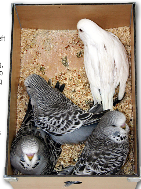
If you find eggs in the nest-box when you move the hen and she has a record of producing outstanding youngsters, these can be given to another hen to foster

The hen should not be deprived of the nest-box until the youngest chick is at least four-and-a-half weeks old