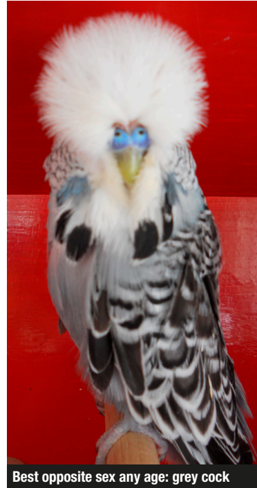
Best opposite sex any age: grey cock